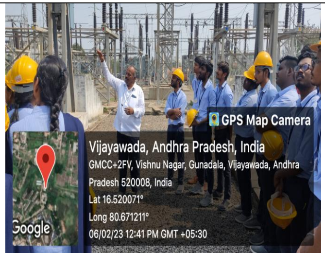
Students are visiting 220 KV incoming transmission lines and its protection components