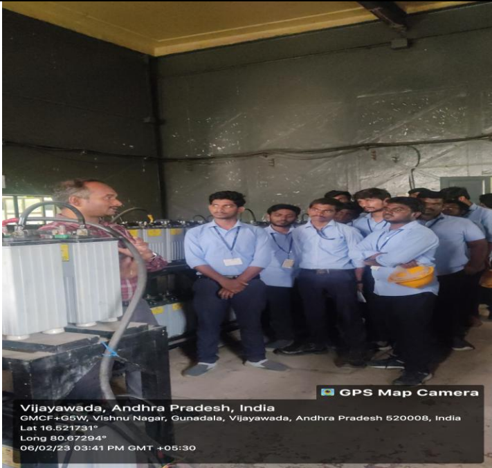
Students visited the substation battery room