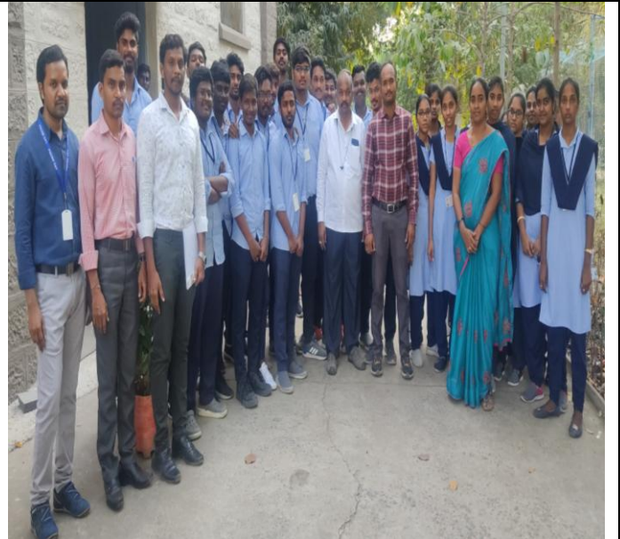
Group photo with ADE sir's